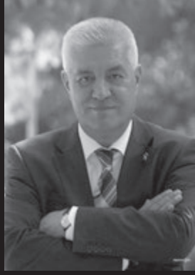
Chairman of the board